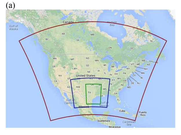
Figure 1. (a) The soil moisture analysis will be conducted for the 12-km (blue) grid domain with an emphasis on the 4-km domain (green) that encompasses eastern Texas. (b) Thirty-six land cover/land use types in eastern Texas with boundaries of Texas climate divisions and developed metropolitan areas shown in red.